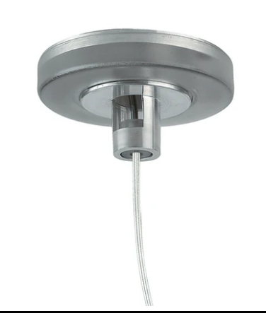
Metal cover. Suspension Up & Down. 35 mm (Colour Black) 08.9056.NS

Metal cover. Suspension Up & Down. 35 mm 08.9056.06