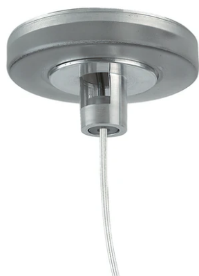
Power supply rose 08.0031.00