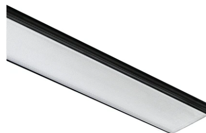
500 mm micro-prismatic diffuser. Highly efficient multilayer diffuser that, thanks to its unique microprismatic texture, provides a glare free UGR<19 light beam 08.0112.00