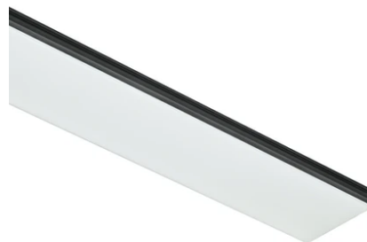
Metal cover. Suspension Up & Down. 35 mm (Colour Anodized Grey) 08.9056.02