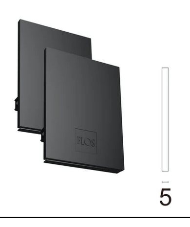
Metal cover. Suspension Up & Down. 35 mm (Colour Black) 08.9056.NS