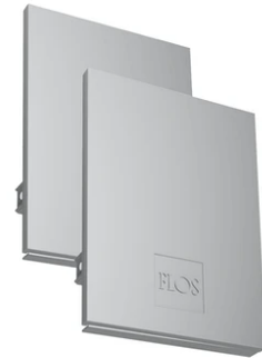
Metal cover. Suspension Up & Down. 35 mm 08.9056.06