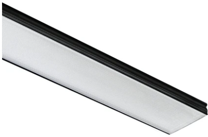
500 mm micro-prismatic diffuser. Highly efficient multilayer diffuser that, thanks to its unique microprismatic texture, provides a glare free UGR<19 light beam 08.0112.00