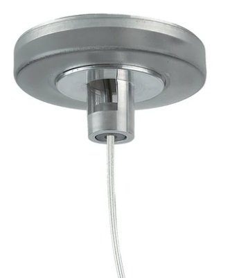
Metal cover. Suspension Up & Down. 35 mm (Colour Black) 08.9056.NS