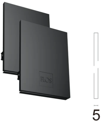
Metal cover. Suspension Up & Down. 35 mm 08.9056.06