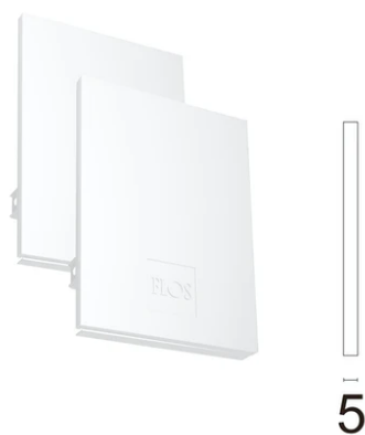
Metal cover. Suspension Up & Down. 35 mm (Colour White) 08.9056.40