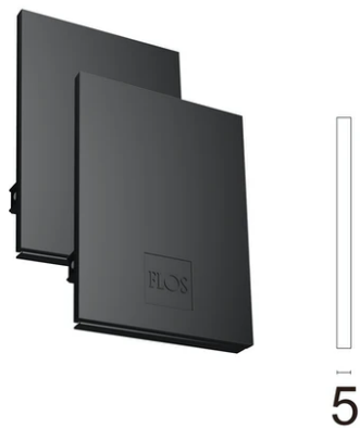
Metal cover. Suspension Up & Down. 35 mm (Colour Black) 08.9056.06