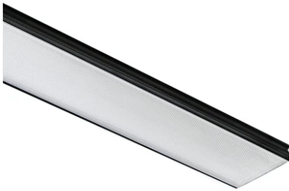
500 mm micro-prismatic diffuser. Highly efficient multilayer diffuser that, thanks to its unique microprismatic texture, provides a glare free UGR<19 light beam 08.0112.00