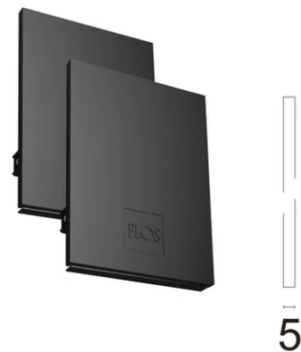
Metal cover. Suspension Up & Down. 35 mm 08.9056.06