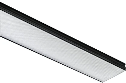
500 mm micro-prismatic diffuser. Highly efficient multilayer diffuser that, thanks to its unique microprismatic texture, provides a glare free UGR<19 light beam 08.0112.00