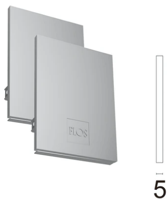
Metal cover. Suspension Up & Down. 35 mm (Colour Anodized Grey) 08.9056.02