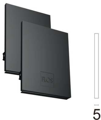
Metal cover. Suspension Up & Down. 35 mm (Colour Black) 08.9056.06