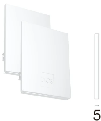
Metal cover. Suspension Up & Down. 35 mm (Colour White) 08.9056.40