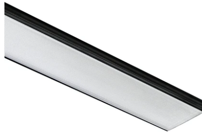
500 mm micro-prismatic diffuser. Highly efficient multilayer diffuser that, thanks to its unique microprismatic texture, provides a glare free UGR<19 light beam 08.0112.00