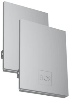
Metal cover. Suspension Up & Down. 35 mm (Colour White) 08.9056.40