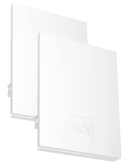
Metal cover. Suspension Up & Down. 35 mm 08.9056.06