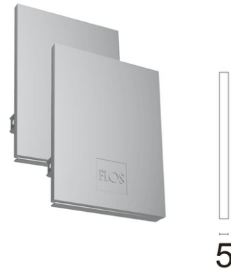
Metal cover. Suspension Up & Down. 35 mm (Colour Anodized Grey) 08.9056.02