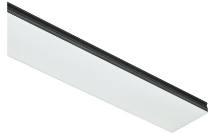
500 mm opal diffuser. Diffuse, glare free and uniform lighting throughout the room 08.0109.00