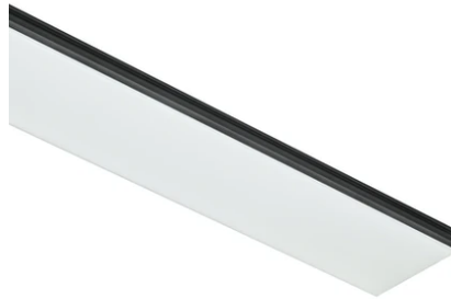
500 mm opal diffuser. Diffuse, glare free and uniform lighting throughout the room 08.0109.00