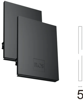
Metal cover. Suspension Up & Down. 35 mm 08.9056.06