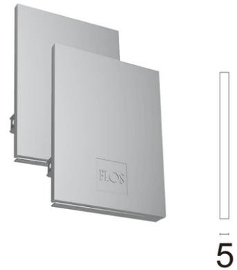
Metal cover. Suspension Up & Down. 35 mm (Colour Anodized Grey) 08.9056.02