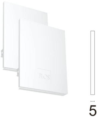
Metal cover. Suspension Up & Down. 35 mm (Colour White) 08.9056.40