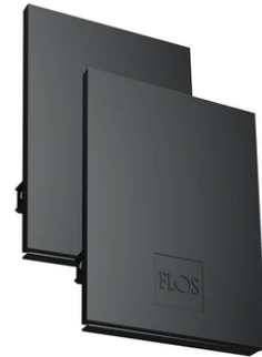
Metal cover. Suspension Up & Down. 35 mm (Colour White) 08.9056.40