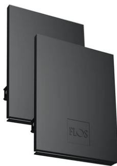
Metal cover. Suspension Up & Down. 35 mm 08.9056.06