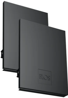
500 mm opal diffuser. Diffuse, glare free and uniform lighting throughout the room 08.0109.00