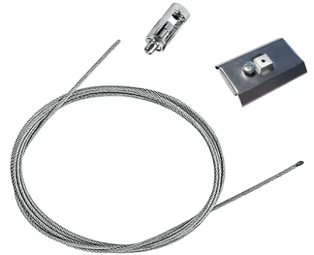
Metal cover. Suspension Up & Down. 35 mm 08.9056.06