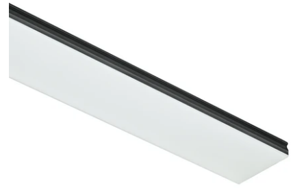
Metal cover. Suspension Up & Down. 35 mm (Colour Anodized Grey) 08.9056.02