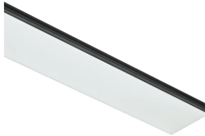
500 mm opal diffuser. Diffuse, glare free and uniform lighting throughout the room 08.0109.00