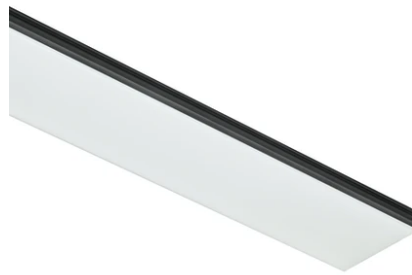
500 mm opal diffuser. Diffuse, glare free and uniform lighting throughout the room 08.0109.00