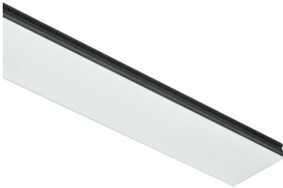
500 mm opal diffuser. Diffuse, glare free and uniform lighting throughout the room 08.0109.00