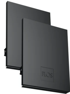
Metal cover. Suspension Up & Down. 35 mm 08.9056.06