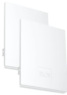
Metal cover. Suspension Up & Down. 35 mm (Colour Anodized Grey) 08.9056.02