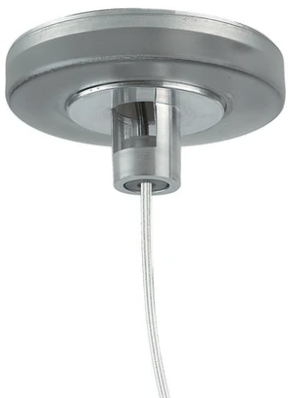
Power supply rose 08.0031.00