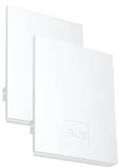
Metal cover. Suspension Up & Down. 35 mm (Colour Anodized Grey) 08.9056.02