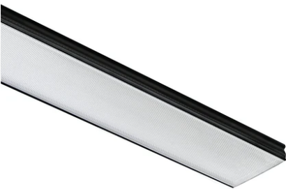
500 mm micro-prismatic diffuser. Highly efficient multilayer diffuser that, thanks to its unique microprismatic texture, provides a glare free UGR<19 light beam 08.0112.00