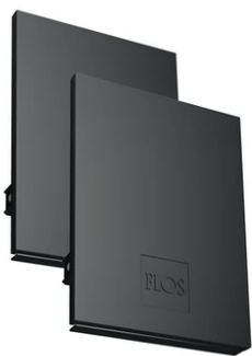
Metal cover. Suspension Up & Down. 35 mm 08.9056.06