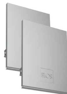
Metal cover. Suspension Up & Down. 35 mm (Colour White) 08.9056.40