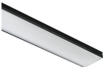
500 mm micro-prismatic diffuser. Highly efficient multilayer diffuser that, thanks to its unique microprismatic texture, provides a glare free UGR<19 light beam 08.0112.00