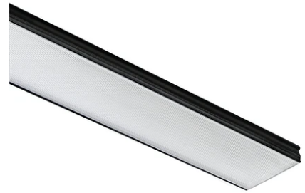
500 mm micro-prismatic diffuser. Highly efficient multilayer diffuser that, thanks to its unique microprismatic texture, provides a glare free UGR<19 light beam 08.0112.00