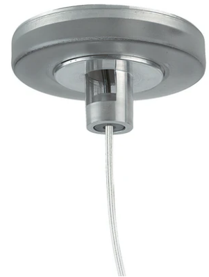
Power supply rose 08.0031.00