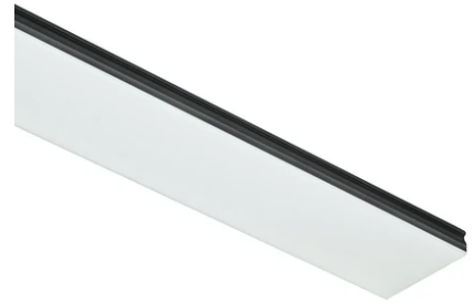
500 mm opal diffuser. Diffuse, glare free and uniform lighting throughout the room 08.0109.00