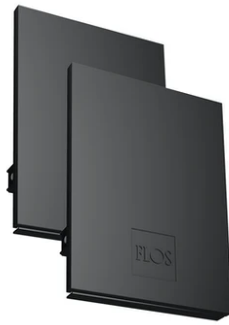
Metal cover. Suspension Up & Down. 35 mm (Colour Anodized Grey) 08.9056.02