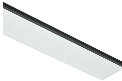
500 mm opal diffuser. Diffuse, glare free and uniform lighting throughout the room 08.0109.00