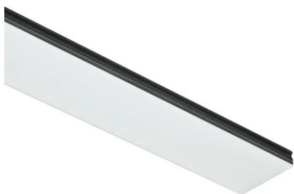
500 mm opal diffuser. Diffuse, glare free and uniform lighting throughout the room 08.0109.00