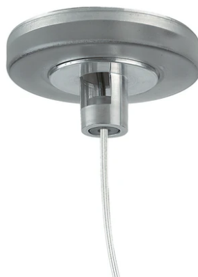
Power supply rose. Dali 08.0031.00.DA