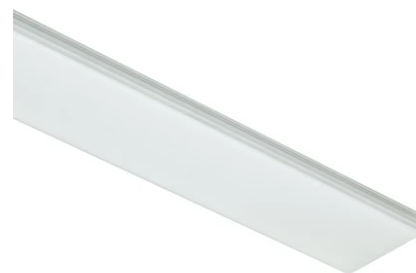
500 mm opal diffuser. Diffuse, glare free and uniform lighting throughout the room 08.0109.00