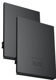
Metal cover. Suspension Up & Down. 35 mm (Colour Anodized Grey) 08.9056.02