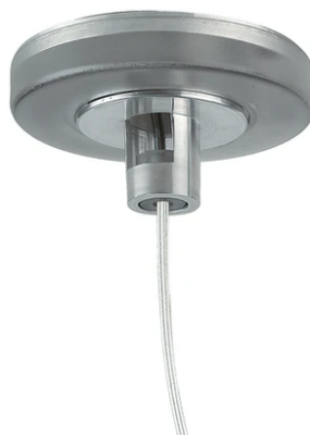
Power supply rose. Dali 08.0031.00.DA