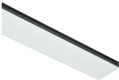
500 mm opal diffuser. Diffuse, glare free and uniform lighting throughout the room 08.0109.00