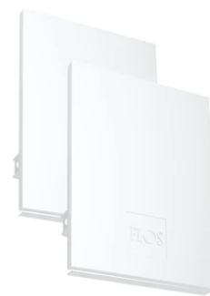
Metal cover. Suspension Up & Down. 35 mm (Colour White) 08.9056.40