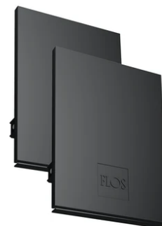
Metal cover. Suspension Up & Down. 35 mm 08.9056.06