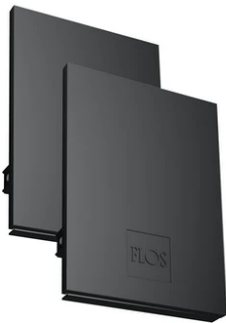
Metal cover. Suspension Up & Down. 35 mm 08.9056.06