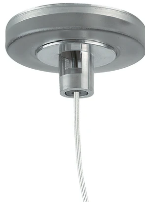
Power supply rose. Dali 08.0031.00.DA