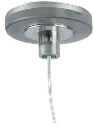
Power supply rose. Dali 08.0031.00.DA