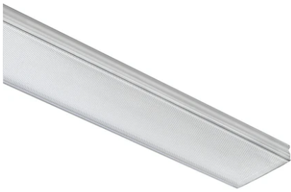
500 mm micro-prismatic diffuser. Highly efficient multilayer diffuser that, thanks to its unique microprismatic texture, provides a glare free UGR<19 light beam 08.0112.00