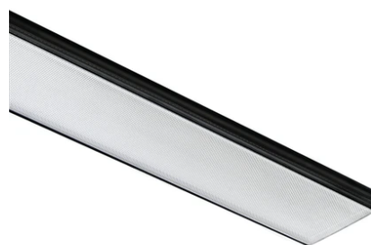
500 mm micro-prismatic diffuser. Highly efficient multilayer diffuser that, thanks to its unique microprismatic texture, provides a glare free UGR<19 light beam 08.0112.00