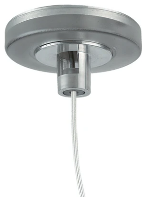
Power supply rose. Dali 08.0031.00.DA