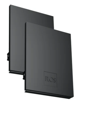
Metal End Cap. Recessed No Trim / Surface / Suspension Down. 35 mm (Colour Black) 08.9050.NS