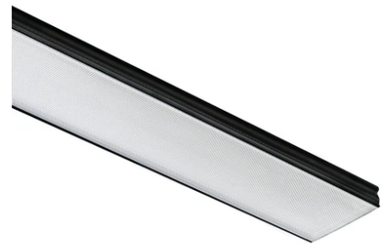
500 mm micro-prismatic diffuser. Highly efficient multilayer diffuser that, thanks to its unique microprismatic texture, provides a glare free UGR<19 light beam 08.0112.00