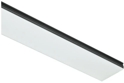
500 mm opal diffuser. Diffuse, glare free and uniform lighting throughout the room 08.0109.00