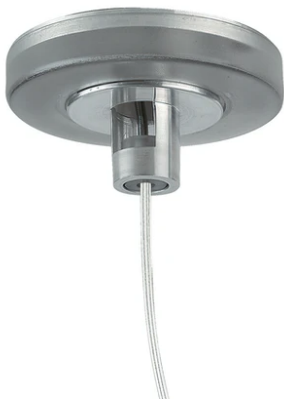
Power supply rose 08.0031.00