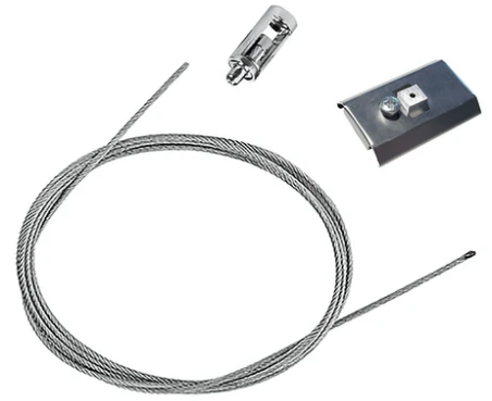
Metal cover. Surface / Suspension Down. 35 mm 08.9050.06