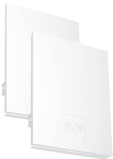
500 mm opal diffuser. Diffuse, glare free and uniform lighting throughout the room 08.0109.00