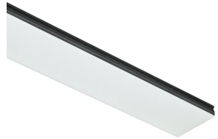
500 mm opal diffuser. Diffuse, glare free and uniform lighting throughout the room 08.0109.00