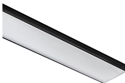
500 mm micro-prismatic diffuser. Highly efficient multilayer diffuser that, thanks to its unique microprismatic texture, provides a glare free UGR<19 light beam 08.0112.00