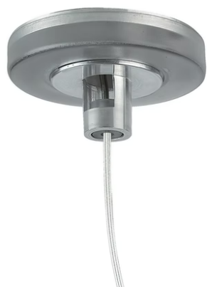
Power supply rose. Dali 08.0031.00.DA