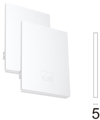
Metal End Cap. Recessed No Trim / Surface / Suspension Down. 35 mm (Colour White) 08.9050.40