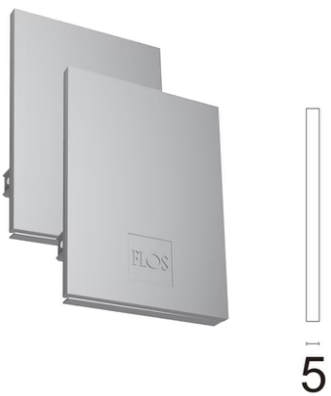
Metal End Cap. Recessed No Trim / Surface / Suspension Down. 35 mm (Colour Anodized Grey) 08.9050.02