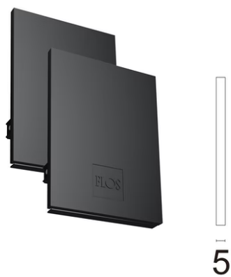
Metal End Cap. Recessed No Trim / Surface / Suspension Down. 35 mm (Colour Black) 08.9050.NS