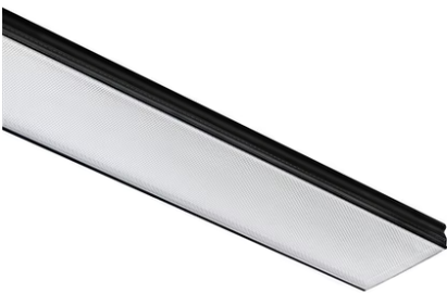
500 mm micro-prismatic diffuser. Highly efficient multilayer diffuser that, thanks to its unique microprismatic texture, provides a glare free UGR<19 light beam 08.0112.00