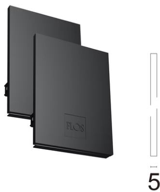
Metal cover. Surface / Suspension Down. 35 mm 08.9050.06