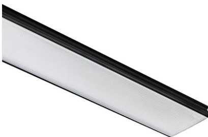
500 mm micro-prismatic diffuser. Highly efficient multilayer diffuser that, thanks to its unique