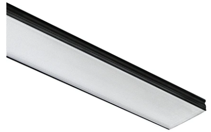
Metal End Cap. Recessed No Trim / Surface / Suspension Down. 35 mm (Colour White) 08.9050.40