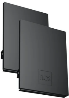
500 mm micro-prismatic diffuser. Highly efficient multilayer diffuser that, thanks to its unique microprismatic texture, provides a glare free UGR<19 light beam 08.0112.00