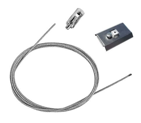
Suspension kit 08.0030