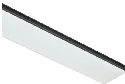
500 mm opal diffuser. Diffuse, glare free and uniform lighting throughout the room 08.0109.00