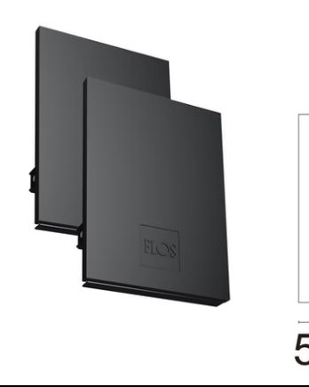
Metal End Cap. Recessed No Trim / Surface / Suspension Down. 35 mm (Colour Black) 08.9050.NS