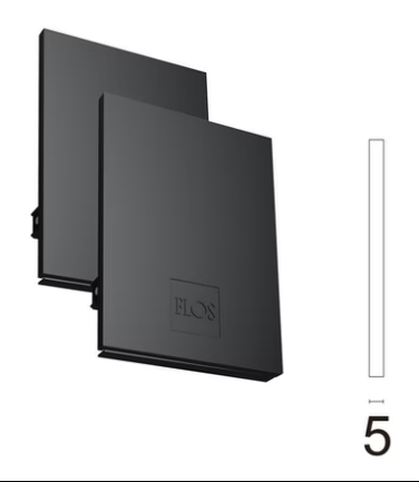
Metal End Cap. Recessed No Trim / Surface / Suspension Down. 35 mm (Colour Black) 08.9050.NS