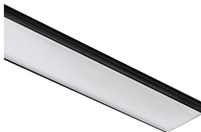
500 mm micro-prismatic diffuser. Highly efficient multilayer diffuser that, thanks to its unique microprismatic texture, provides a glare free UGR<19 light beam 08.0112.00