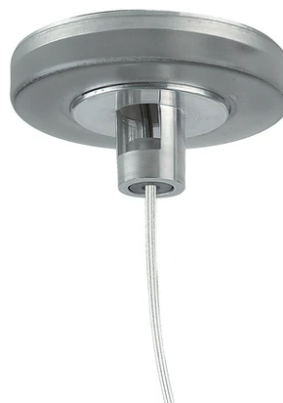
Power supply rose. Dali 08.0031.00.DA