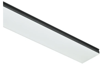
500 mm opal diffuser. Diffuse, glare free and uniform lighting throughout the room 08.0109.00