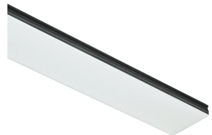
500 mm opal diffuser. Diffuse, glare free and uniform lighting throughout the room 08.0109.00